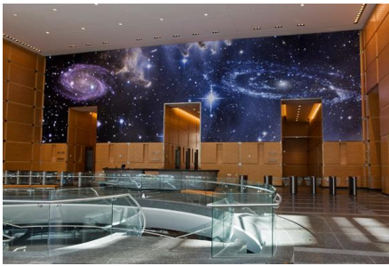
Comcast Center 1701 John F. Kennedy Boulevard Philadelphia, PA