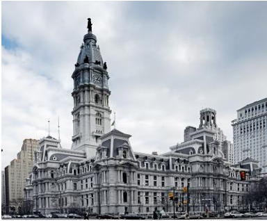
Philadelphia City Hall Broad Street and Market Street